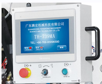
電腦顯示屏 Computer screen

※ The description and features mentioned on the catalogues are binding any change mayde made without notice.