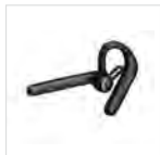
BT Wireless earpiece