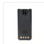
Li-polymer battery 2400mAh