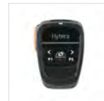
BT Wireless remote speaker microphone