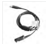
Programming cable (USB port)