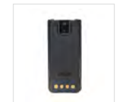
Li-polymer battery 3000mAh