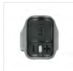
BT wireless ring PTT